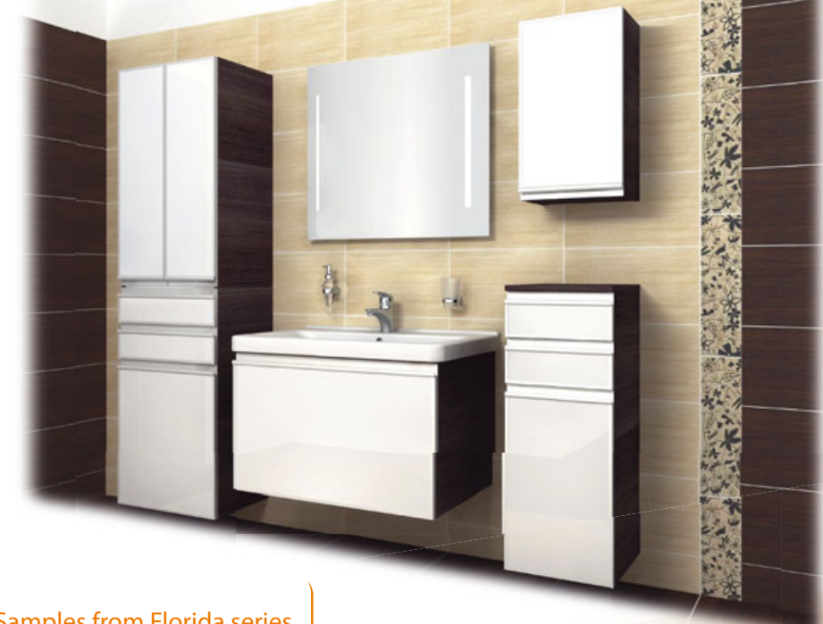
Samples from Florida series