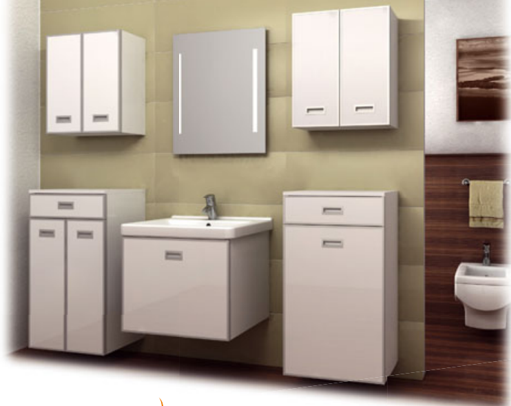
Samples from Florida series